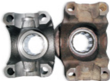
Our new yoke on the left and the stock yoke on the right.

Jeeps 1965 and earlier with the Dana 18 transfer case used a large diameter yoke. When installing these transfer cases up to the GM TH350 transmission, you will run into a yoke clearance issue on the transmission pan. We offer a smaller yoke kit for the early version Dana 18 for this clearance problem. This kit is, P/N 716009 which includes the new transfer case yoke bearing cross and stub yoke.