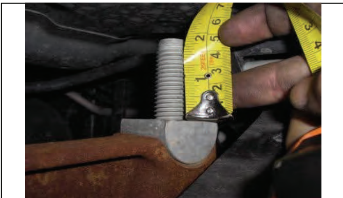
Measure threads on top of torsion bar adjusting block