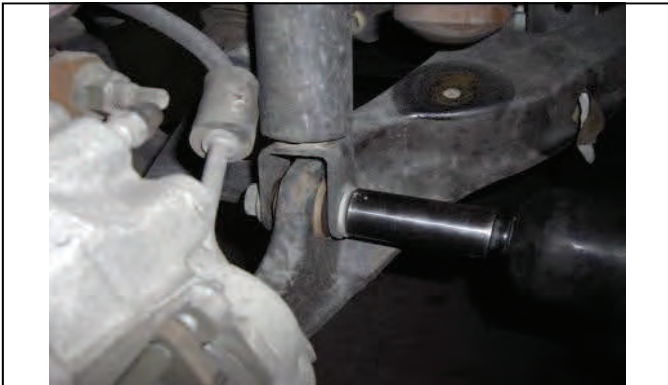
Remove lower shock mounting bolt/nut