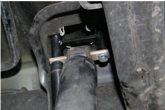
Install upper shock extensions and new hardware.

Reinstall wheels/tires and torque to spec. Re-check all work performed and torque all hardware to spec. Test drive and have vehicle aligned.