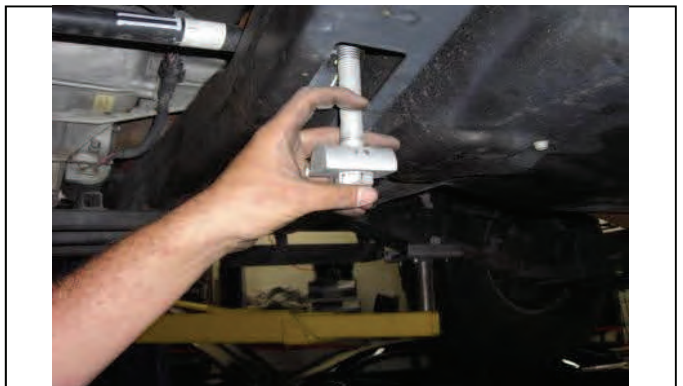
Then remove torsion bar adjusting block and bolt