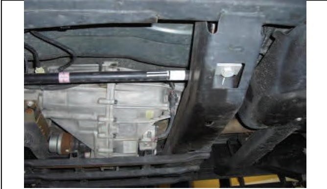
Raise and support vehicle on jack stands, locate torsion bars