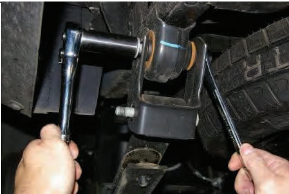
Support axle and disconnect/remove shackles and hardware.