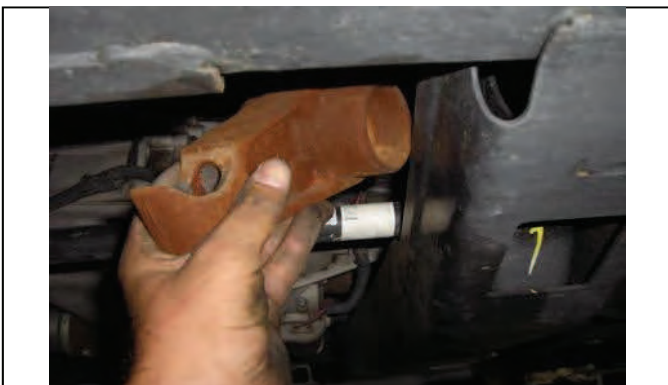
Remove OE torsion key