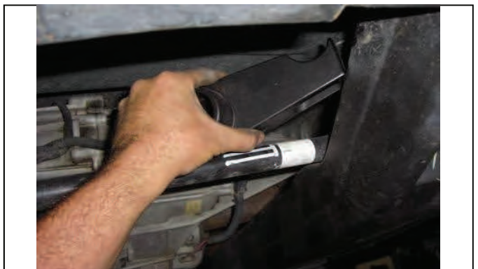
Install new ReadyLIFT forged torsion key