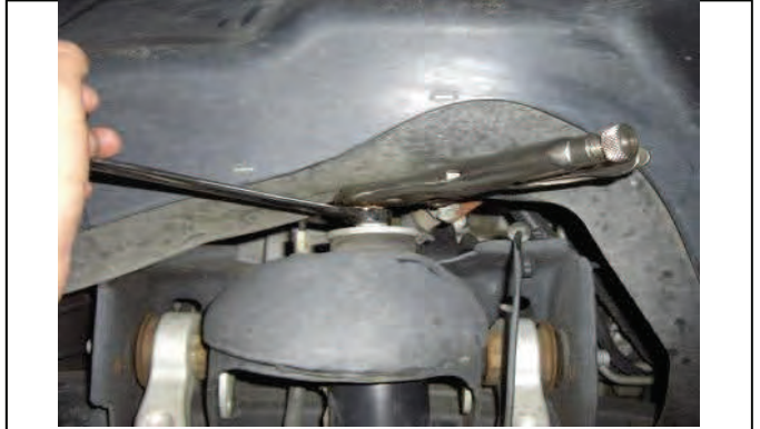
Remove upper shock mounting hardware