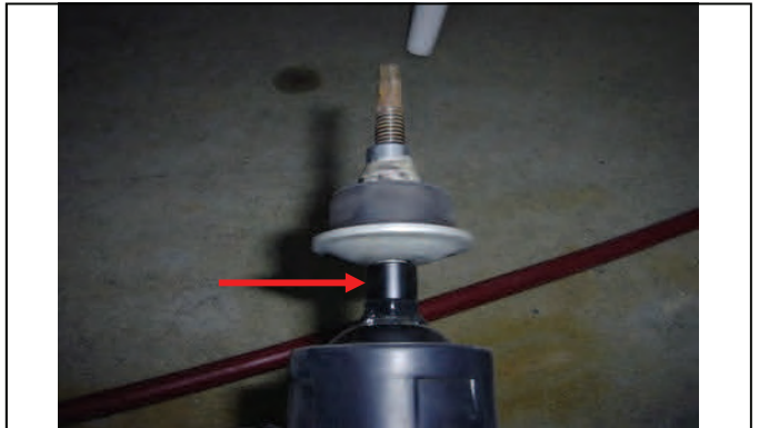
Install spacer underneath bottom shock bushings