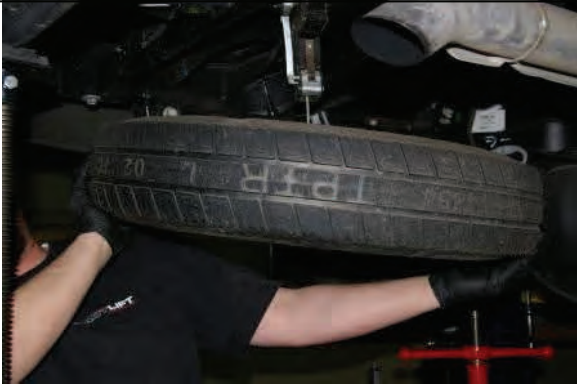
Remove spare tire in order to remove shackle bolts