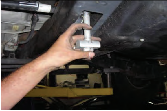
Reinstall adjustment bolt and block to original measurements

Note: Torsion bars can be adjusted to the initial thread measurements on the adjusting bolts. Once the rear parts are installed and with the vehicle on the ground the necessary adjustments can be made and finalized by the alignment shop.