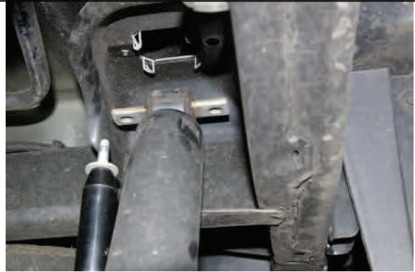
Disconnect upper shock mounting bolts