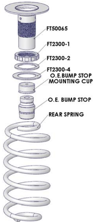
REAR ASSEMBLY SHOWN ABOVE