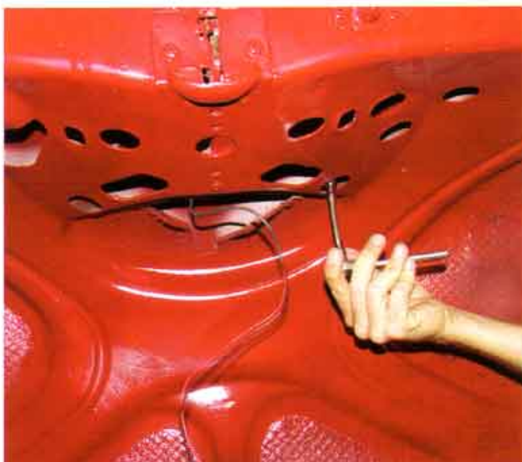
Photo #3: The 1955-56 style brake lamp is self-grounding, so make sure there is no paint under one of the retaining nuts inside the trunk when it is bolted into place.