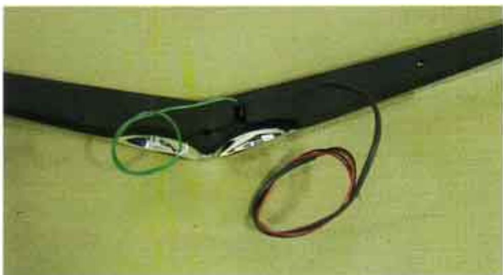
Photo #6: The 1957 trunk emblem #28-47 Chrome or #28-48 Gold has three wires. The

Photo #5a & 5b: Perform a quick test of your installation. When the running lamps are on, two of the LED lamps should illuminate. When the brake lamps are on, the complete emblem will illuminate for a super bright third brake lamp.