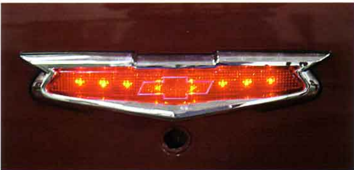
Photo #5a & 5b: Perform a quick test of your installation. When the running lamps are on, two of the LED lamps should illuminate. When the brake lamps are on, the complete emblem will illuminate for a super bright third brake lamp.