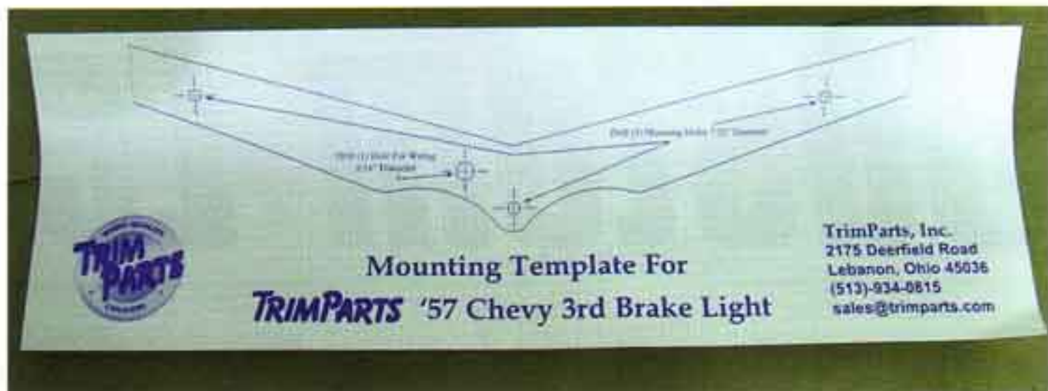
Photo #7: A small hole will need to be drilled in the trunk lid to allow the wires to be routed inside the trunk. A template is supplied showing where the 3/16" hole needs to be drilled.