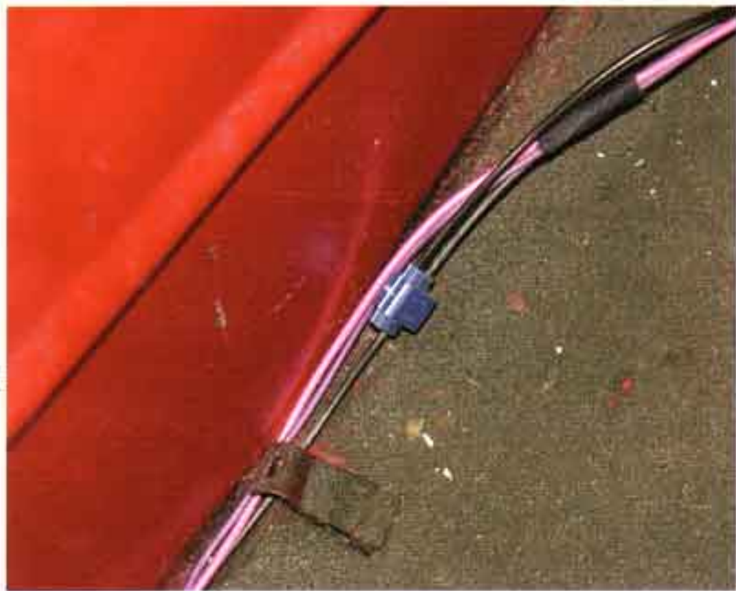
Photo #4: Extend the black and red wires on the lamp assembly with some 18 gauge

wire. Feed the wires through the inner trunk lid and drop them out adjacent to the left hand trunk hinge. Using a scotch lock, connect the black wire on the brake lamp assembly to the black wire in the taillamp harness. Connect the red wire to the white wire on the brake light switch under the dash.