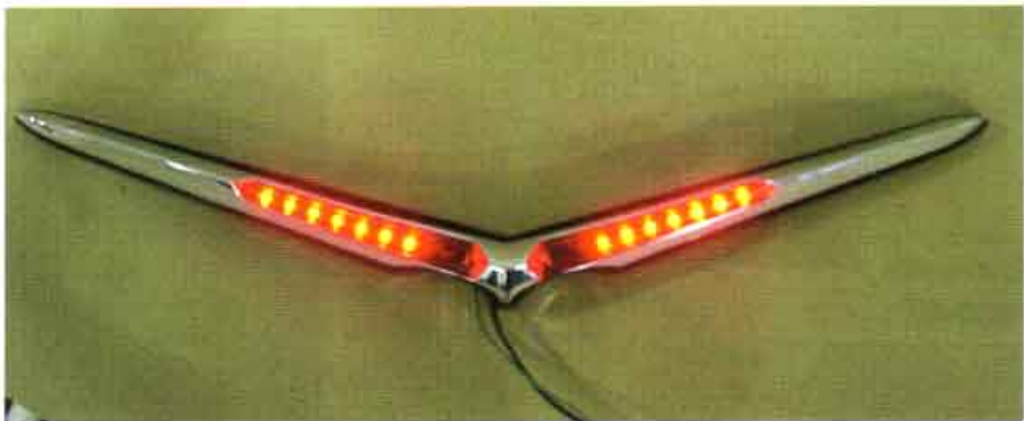
Photo #9: When the brake lamps are on, all seven LED lamps will fully illuminate. This will really light up the back of your car!

Photo #8: For the 1957-style V, when the running lamps are on the top three LED lamps are fully illuminated while three of the lower LED lamps are on at 50 percent brightness.