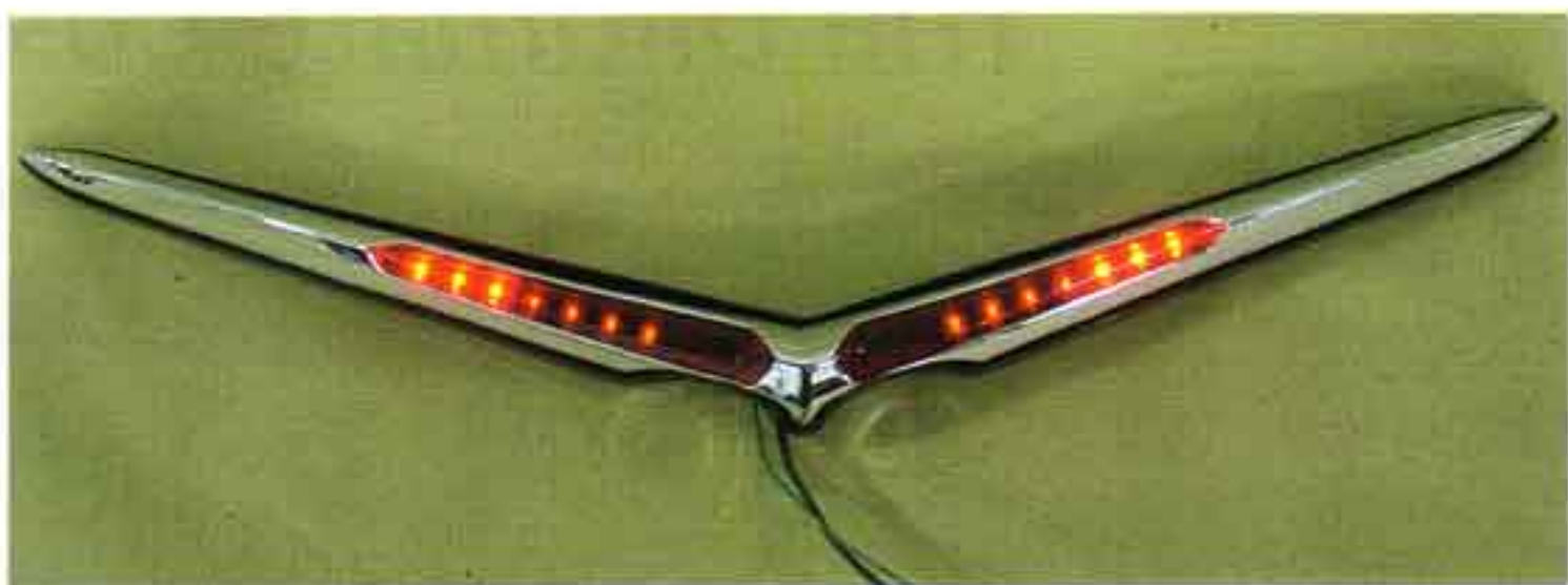
Photo #8: For the 1957-style V, when the running lamps are on the top three LED lamps are fully illuminated while three of the lower LED lamps are on at 50 percent brightness.

Photo #7: A small hole will need to be drilled in the trunk lid to allow the wires to be routed inside the trunk. A template is supplied showing where the 3/16" hole needs to be drilled.