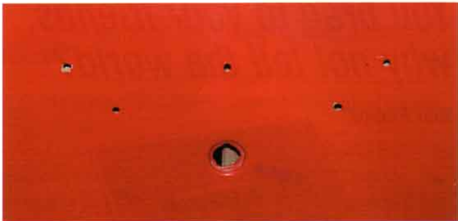
Photo #1: The 1955 rear trunk emblem has four studs and one guide pin in the center that attaches the emblem to the trunk lid. The new LED third brake lamp uses the four holes in the trunk lid to hold the emblem in place. The center hole in the trunk lid will be used to pass the wires from the third brake lamp into the trunk.