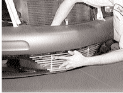
STEP 2 Mount the lower grille at this point. If you don't it will be hard to get to after the upper grille is installed.