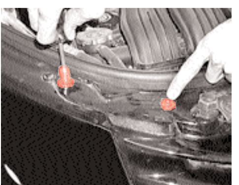
STEP 1 Open hood & remove the 4-Hex head screws fro the to of the stock grille. Then push down them pull out & up to remove the stock grille.