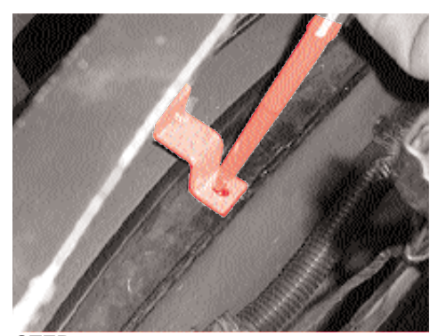
STEP 4 Mount Billet Grille using factory screws from top of grille. Then mark the location that the bottom bracket sits on the steel bumper box. After you mark the location of bracket remove grille and remove the bracket from the billet grille.

STEP 5 Drill 1/8" hole at the marked location of the bracket in the steel bumper box. Mount the bracket to the steel bumper box with #8 screws. Now install Billet Grille.