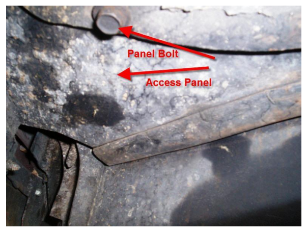
Access panel as seen from underneath car.

3. Clean Dirt and Oil. Included in your kit are alcohol swabs that should be used to clean the vent area in preparation for installation of the grille.