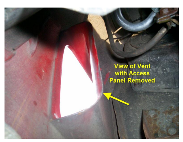
View of vent from underneath car with access panel removed.