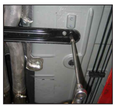
FIG. H INS5056 2/23/06