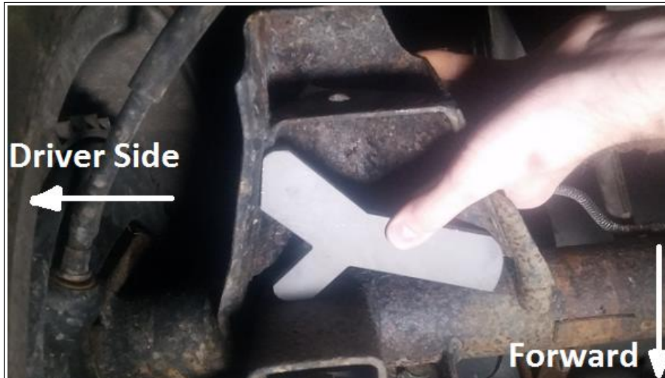
Figure 10 (Directly under the axle)