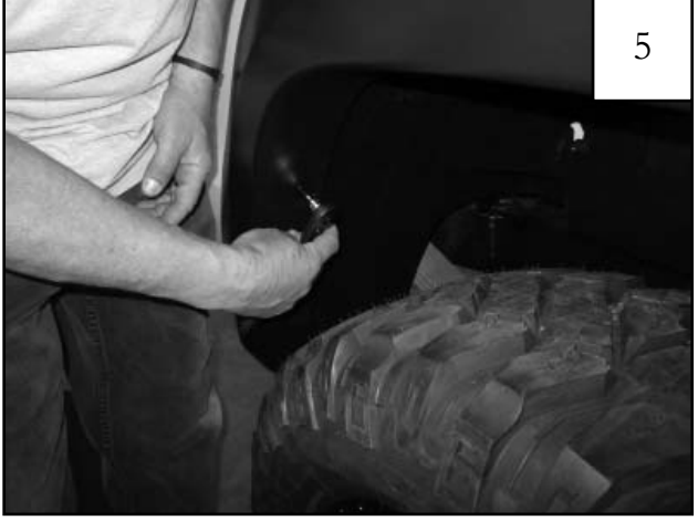
Place flare on vehicle and install one factory screw where shown to hold in place.