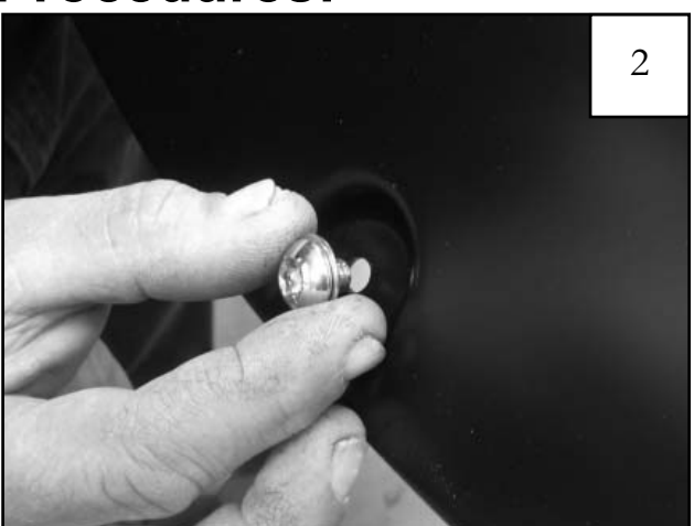
Put each Bolt/Washer combination through a pocket hole in the flare, Bolt head and Washer on the outside.