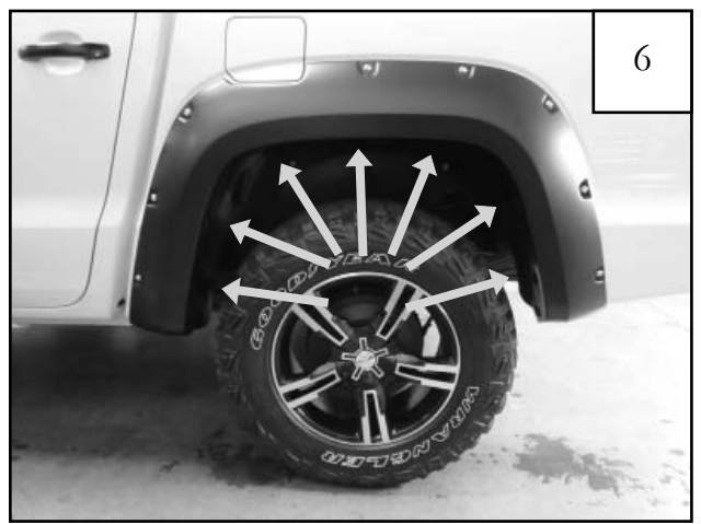
Using T-45 Torx bit, install 7 factory screws. Fully tighten all screws while pressing in on flare to ensure it is snug against sheet metal.