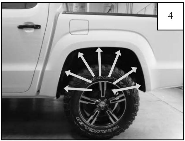
Using an T-25 Torx bit, remove 7 factory screws. Retain screws for reinstallation.