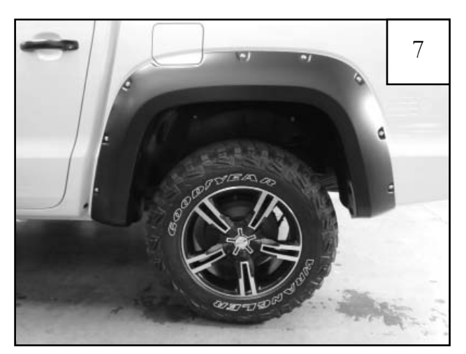
Remove flare and enlarge the marks on bumper cover.