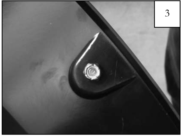
Place a Nut (NU1-0019) over the end of each Bolt and tighten, using a 1/2" wrench for the Nut and the supplied Torx Bit (SW1-0052) for the Bolt. Repeat for remaining pockets.