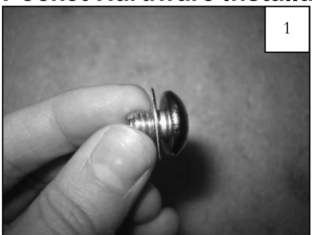
Put a Washer (WA1-0012) on each Bolt (SW1-0059).