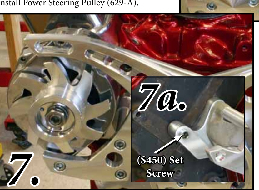
FIG 7. Install (S450) threaded bushing into alternator rear support bracket (as shown Fig 7a). Install the Alternators (P573) using (1) \frac{3}{8} x 5\frac{1}{2} " SHCS (S280) and a TP3-1.775 Spacer Between the rear of the Alt and the (S450) Set Screw. Turn the S450 set screw to take up any slack between the lower alternator support and the spacer. Secure with a \frac{3}{8} " Lock Nut. (S622). (snug only at this time).

FIG 6. Install the Power Steering Unit (P304 / 9600) to the main bracket. Mount thru the main bracket into the lower hole of the adapter bracket using a \frac{3}{8} x 4^{1}/2^{11} SHCS (S276) between the back of the adapter And the Rear Support Bracket use the (2) Provided Spacers TP3-2.900 and TP3-.700 And snug into place. Install Power Steering Pulley (629-A).