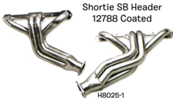
Shortie SB Header 12788 Coated