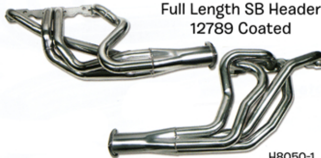
Full Length SB Header 12789 Coated