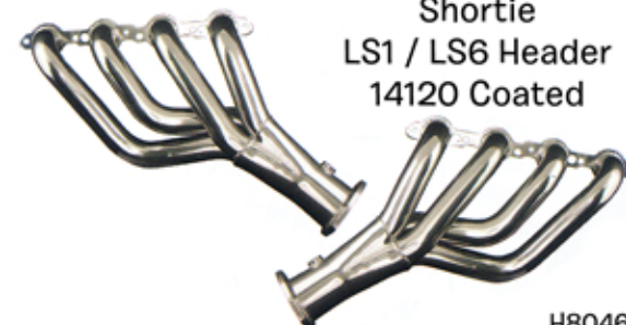
Shortie LS1 / LS6 Header 14120 Coated