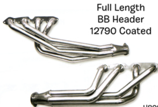
Full Length BB Header 12790 Coated