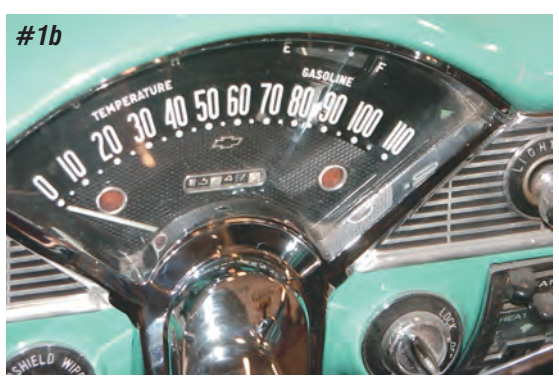
Photo #1a & 1b: The 1955-56 cars actually had a different instrument bezel between manual and automatic transmissions. On manual shift cars, the window for the indicator was not even cut out. Replacing the bezel can be fairly costly and cutting the window is all but impossible.