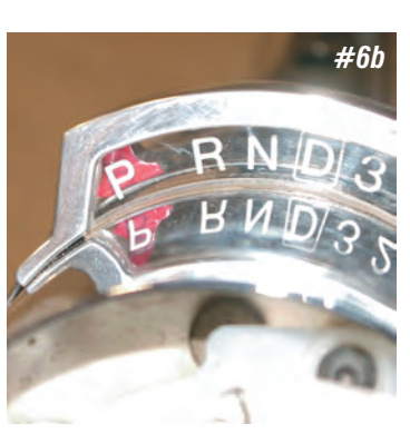
Photo #6a & 6b: Peel the covering from the tape on the pointer and with the steering column in park; place the pointer on the shift collar so that it aligns with the "P" on the indicator lens. This is great way to add a shift indicator to a car the never had one and gives a great custom touch at the same time! Good Luck!