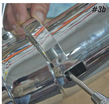
Photo #3a & 3b: With the column in the tilted position, locate the indicator on the steering column head at 12 o'clock. This will put the left hand edge of the billet bezel about 3/8" from the hole in the column for the tilt lever.