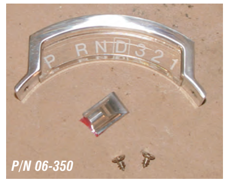
Photo #2: The new shift indicator anchors to the head of the steering column with two sheet metal screws while the pointer anchors to the shift collar with double sided tape. The indicator has a clear lens with a polished billet bezel and billet

pointer. If the steering column is painted, the billet bezel and pointer may be painted to match the color of the steering column. P/N 06-350 is for a three-speed automatic and P/N 06-351 is for a four-speed automatic.