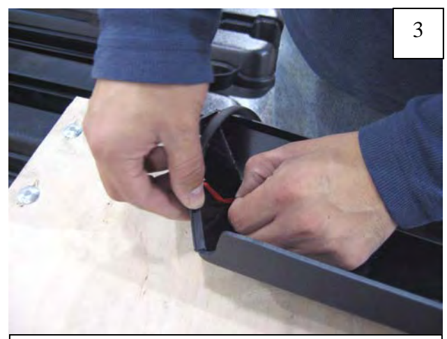
Applying the adhesive side of the edge trim to the inner side of part, affix edge trim to the top edge of the part (the portion that comes in contact with vehicle).