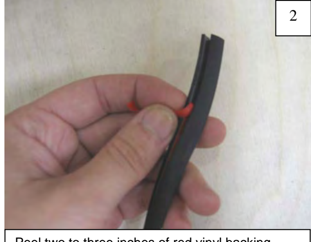
Peel two to three inches of red vinyl backing away from edge trim tape.