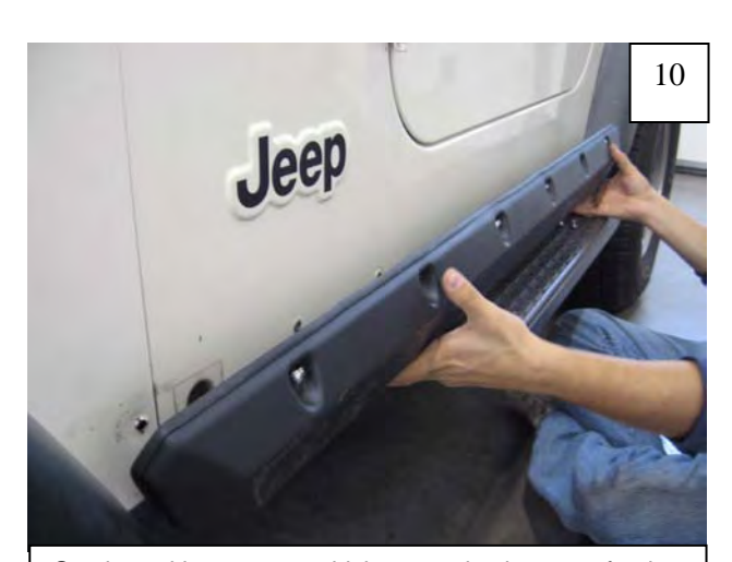
Gently position part on vehicle, centering between fender flares (about 1/4" to 3/8" space on each side). Take care not to press the part onto vehicle until properly positioned.