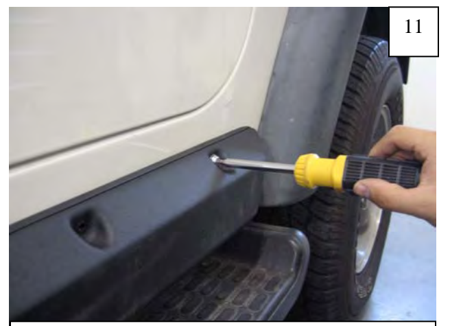
Once part is positioned, press firmly on screw heads to adhere inner pieces to vehicle. Remove screws and remove outer part from vehicle, leaving the inner pieces on the body.