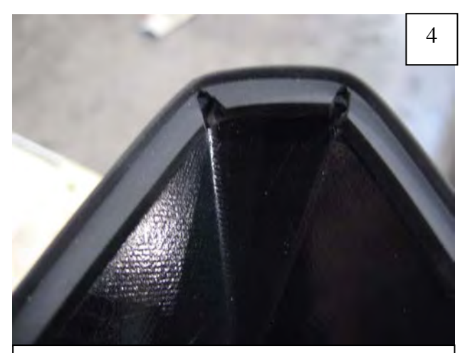
At sharp corners, use a utility knife to notch a "V" in edge trim, taking care not to cut front face of edge trim (four places each part)