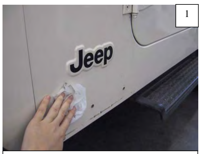
Wipe side of vehicle with alcohol wipe to remove grease and dirt.