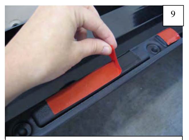
Remove red vinyl backing from tape pads. NOTE: Check part for engraved "14008R" or "14008L" prior to proceeding to the next step. The left part will go on the driver's side.