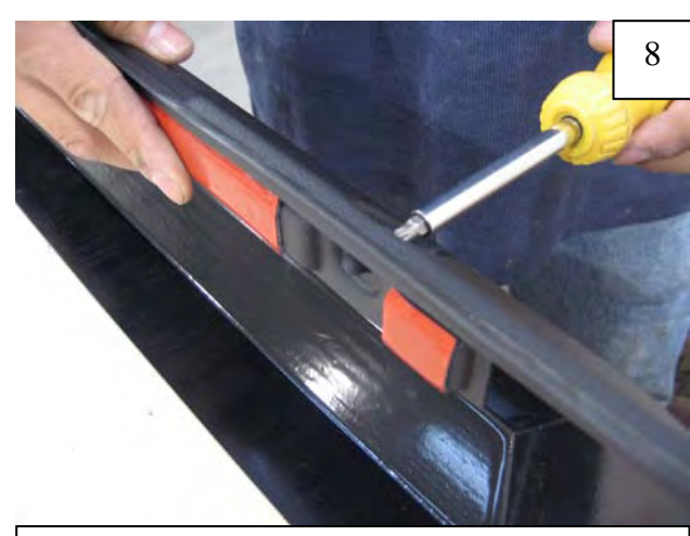
Using supplied Torx bit, start a screw/washer through each pocket into the indent in the inner piece (4-5 turns). Do NOT tighten!