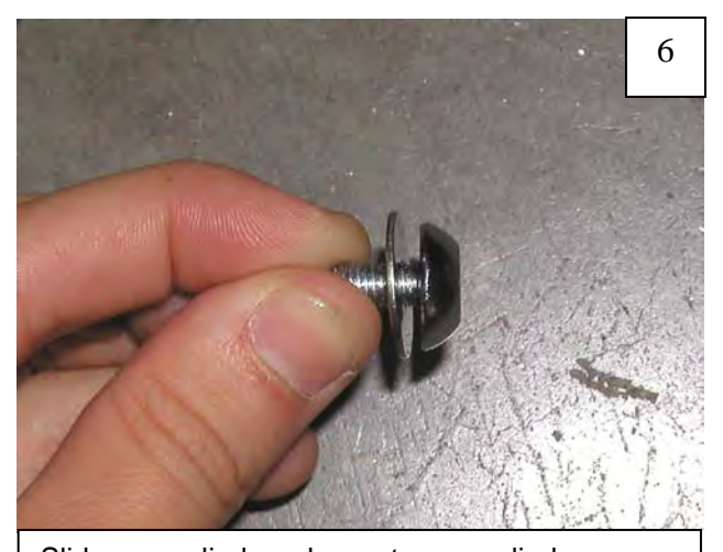
Slide a supplied washer onto a supplied screw.