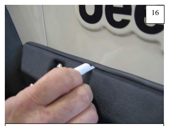
Using flat end of supplied Edge Trim Tool, seat bottom edge of edge trim first by inserting straight flat end between bottom edge of edge trim and part at one open end and slide over entire top edge to the other end.