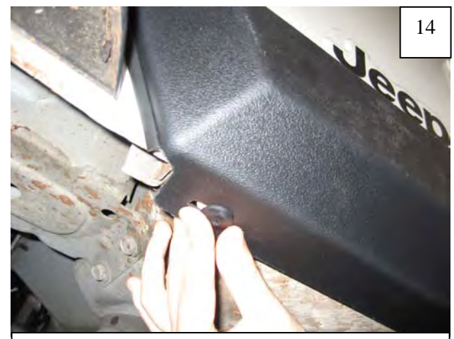
Attach underside edge of the Rocker Panel to the vehicle using supplied Tuf-Lok® fasteners, pressing Tuf-Loks through slots and into factory holes.