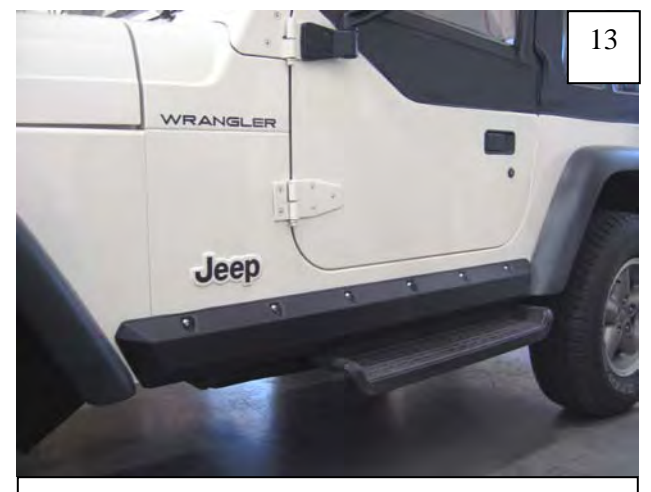
Reinstall part as shown in Step 8, taking care that screws are snug. Do NOT overtighten, as the screws may strip out.