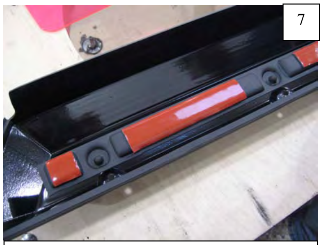
Align three indents in each taped inner piece with three holes in parts. Tape attached to inner pieces should be facing away from the inside of the part.