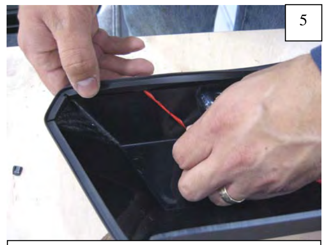
Press edge trim into place along the top edge of the flare in one foot increments, pulling red vinyl backing free as you go.