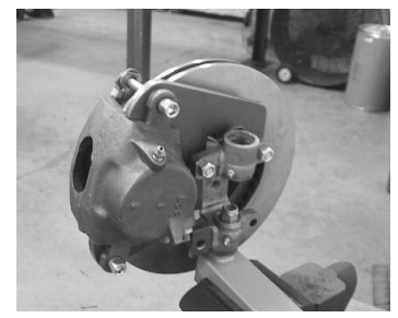
Step 9: The caliper will fit over the rotor and is held to the disc brake bracket with two 3/8" anchor bolts, make sure the bleeder on the caliper is oriented towards the top.