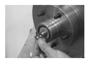
Step 6: A spacer is installed between the spindle nut and spindle washer.