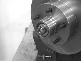
Step 8: Now install the new