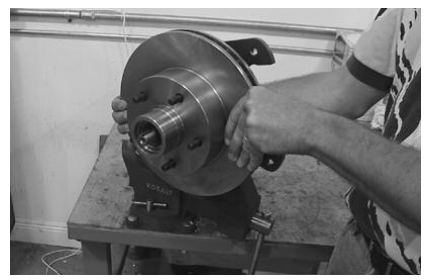
Step 4: With the inner wheel bearing and seal installed, place the disc brake rotor onto the spindle.