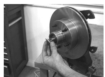
Step 5: Next install the outer wheel bearing and spindle washer.