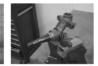
Step 1: First install the inner wheel bearing and seal adapter, make sure the adapter is firmly seated againts the shoulder of the spindle.