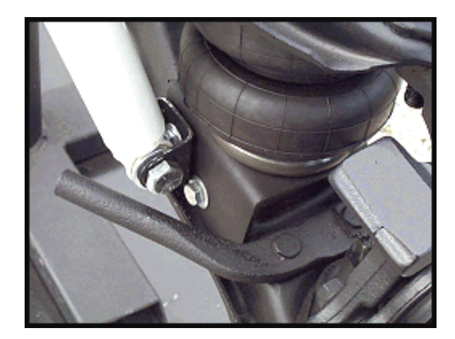
(lower shock detail)